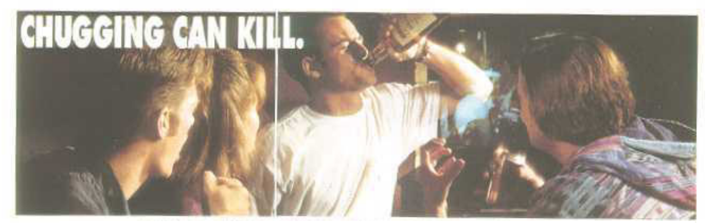
Figure 1. Campaign Poster

Anyone who drinks too much alcohol too fast can die from alcohol poisoning. Even you.